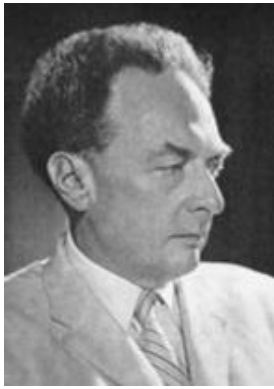
After a serious accident, linguist Roman Jakobson compulsively translated every sentence into four different languages.

expert in polyglott aphasia who is not only a multilingual himself but also the parent of multilingual children, there are several standard questions which medical staff will routinely need answers to: